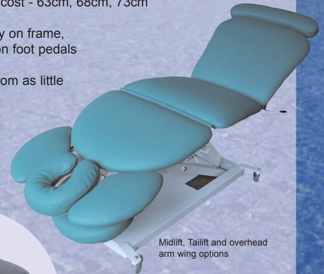
Midlift, Tailift and overhead arm wing options